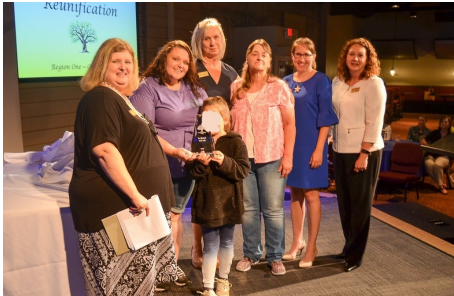
Region 1 Reunified Family of the Year