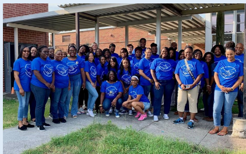
Members of the "Back to School Bash" Team

Richmond County DFCS was one of many that have recently hosted a back-to-school event. During this "Back to School Bash", they gave away book bags loaded with school