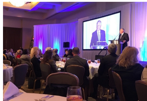
Governor Deal addresses The Summit attendees

The result of strong collaboration among the Office of the Child Advocate, the Supreme Court Committee on Justice for Children, and DFCS, The Summit is intended to be an annual event that will highlight the work done by those lawyers, judges, and case managers on the front lines of the fight for child protection, permanency, and well-being. In addition to general discussions on the parent-